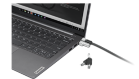
NanoSaver Cable Lock from Lenovo