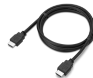
Lenovo Ultra High Speed HDMI™ Cable 1.8m