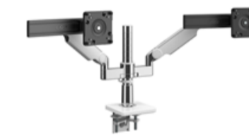
Humanscale Arm for dual monitor configuration, polished aluminum with whit...